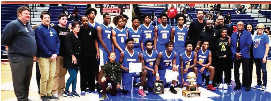
Jemison Jaguars Win Huntsville City 2018 Basketball Classic on December 29