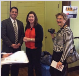
The Church of the Nativity was the site of a Poverty Simulation program.

“Life’s most persistent and urgent question is, ‘What are you doing for others?’”