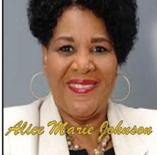
Alice Marie Johnson

Alice Marie Johnson Now a 63-year-old great-grandmother and an ordained minister, Johnson was convicted in 1996 for a first-time nonviolent drug trafficking crime. As a result of the mandatory sentencing laws of the time, she received a life sentence and was expected to live out the rest of her days behind bars. She has a new book of her life's experience "After Life". Her story caught the attention of Kim Kardashian and with Kim's help she was given clemency by the President after 21 years.