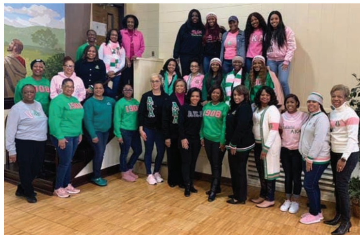
Members of Epsilon Gamma Omega, Gamma Mu and Omicron Zeta Chapters of Alpha Kappa Alpha Sorority, Inc. together after serving lunch at the Downtown Rescue Mission.

This Day of Service answered Dr. King's call, "What are you doing for others?" With a spirit of humility and compassion, the women of Epsilon Gamma Omega, Gamma Mu and Omicron Zeta, served nearly 200 patrons