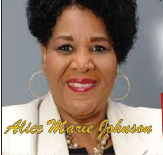
Alice Marie Johnson

Alice Marie Johnson Now a 63-year-old great-grandmother and an ordained minister, Johnson was convicted in 1996 for a first-time nonviolent drug trafficking crime. As a result of the mandatory sentencing laws of the time, she received a life sentence and was expected to live out the rest of her days behind bars. She has a new book of her life's experience "After Life". Her story caught the attention of Kim Kardashian and with Kim's help she was given clemency by the President after 21 years.