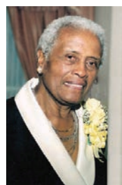
Dr. Charles E. Cannon Scholarship (Alabama A&M

University); Mr. & Mrs. Jerry (Butch) Damson Scholarship Fund; McKinley James Scholarship (J.F. Drake State Community and Technical College); Rosetta James Scholarship