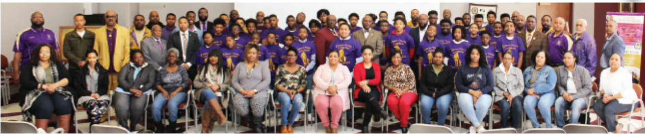
FUTURE FATHERS: Local chapters of Omega Psi Phi Fraternity, Inc., held a "Future Fathers" youth conference Saturday, February 22, at Alabama A&M University. The conference drew local professionals to discuss the challenges of parenting, to provide financial literacy, as well as to address issues brought before them by mothers and fathers in attendance.

"Every man is guilty of all the good he did not do." - Voltaire