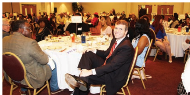
ADC: The Madison County Unit of the Alabama Democratic Conference (ADC) hosted its Annual Membership Breakfast Saturday, February 24, at the Knight Center on the Alabama A&M University campus.