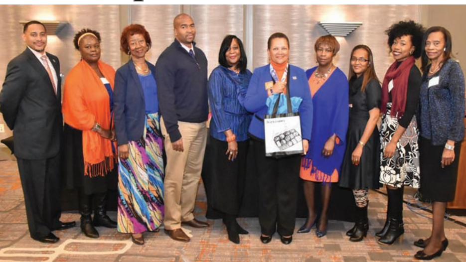
Pictured above, Alabama Chapter Savannah State University Alumni Association, Inc.

The Alabama Chapter Savannah State University National Alumni Association (SSUNAA) Alabama Chapter hosted the Southern Region Conference at the Huntsville Marriott, Huntsville, Alabama, March 5-6. The conference theme was "Upholding Our Impressive Legacy."