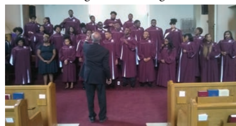
Alabama A&M University Choir