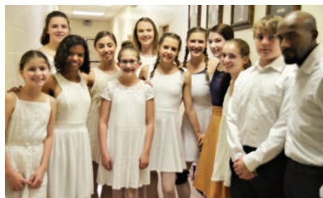
Alabama Youth Ballet