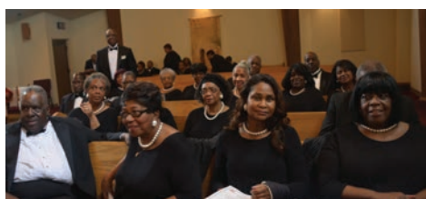
Heritage, Baton Rouge, La.