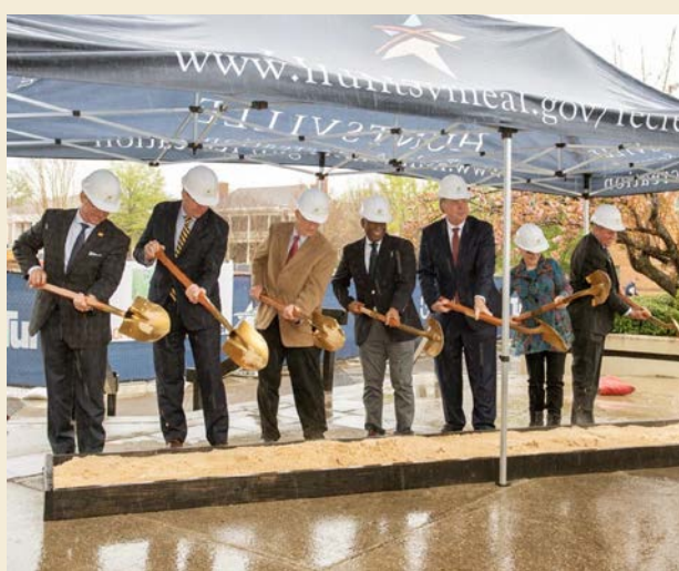
BREAKING GROUND ON CITY HALL: City officials recently participated in a rainy-day ceremonial ground-breaking for Huntsville's new $90 million city hall complex. The new structure will centralize municipal units and enable them to serve the public more efficiently.

Topping the list of the most affordable U.S. cities is (1) Sioux Falls, S.D.; (2) Reno, Nev.; (3) Provo, Utah; (4) Madison, Wis.; (5) Huntsville, Ala. ; (6) Charleston, S.C.; and (7) Fayetteville, Ark.