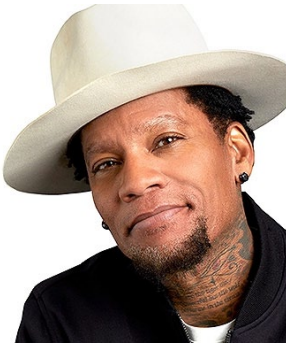
DL can currently be heard nationwide as host of

One of the most popular and highly recognized standup comedians on the road today, Hughley has also made quite an impression in the television, film and radio arenas.