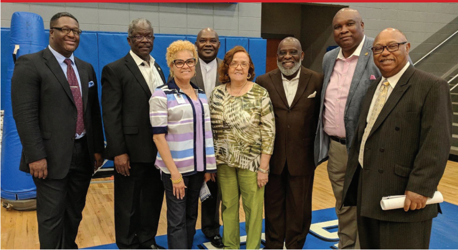
JOB ADVOCATES: Members of J.F. Drake State Community and Technical College and North Huntsville Community United for Action hosted the Advanced Manufacturing Jobs event on Saturday, April 21, at Mae Jemison High School.