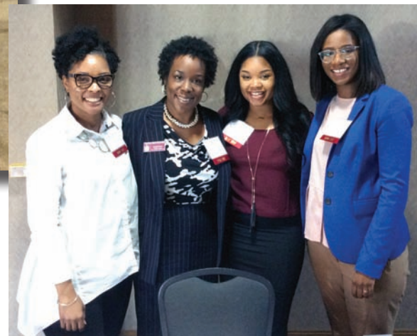
The Future and Beyond Symposium Von Braun Center April 20, 2017