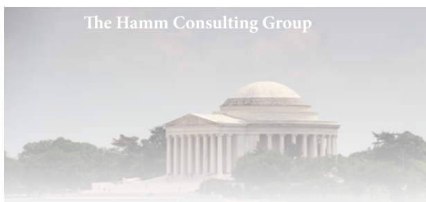
The Hamm Consulting Group