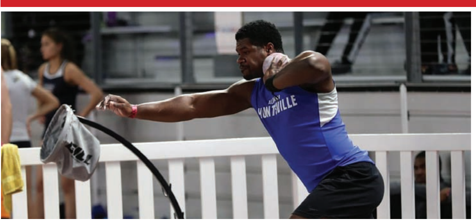
THREE PROGRAM RECORDS: The University of Alabama in Huntsville men's and women's track and field teams competed at the Tennessee Challenge on Saturday (May 5) afternoon, and the squads returned with three program records and six NCAA provisional marks.