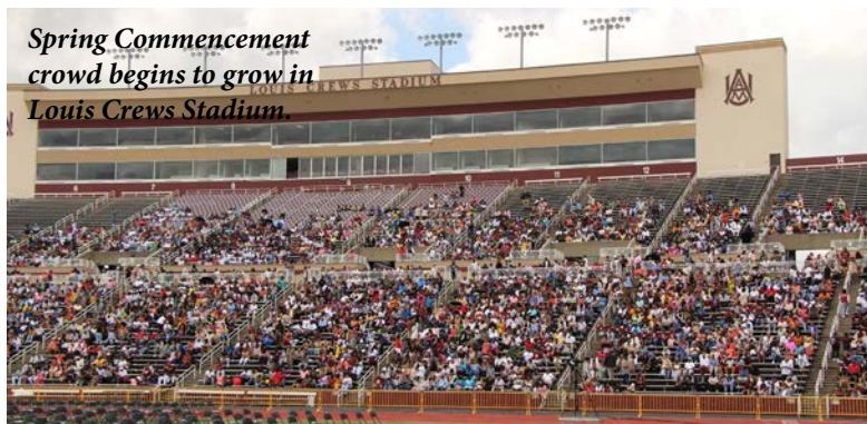
Spring Commencement crowd begins to grow in Louis Crews Stadium.