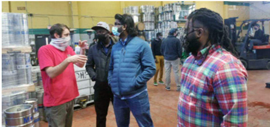
Straight to Ale representative discusses process with AAMU students.

Alabama A&M University officials have announced an innovative collaboration with Huntsville-based brewery Straight to Ale to create a new American Lager.