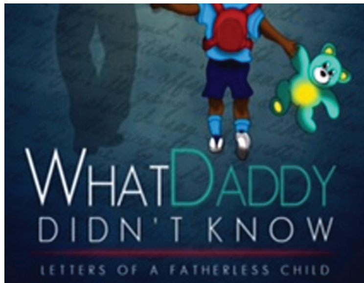
figure was needed the most, and stresses how decisions were most important in his adolescent years.