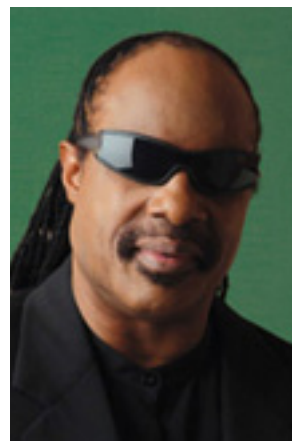
Messengers of Peace, and earning a Presidential Medal of Freedom from President Barack Obama in 2014.

Wonder has been given a many awards for his music, as well as for his civil rights work, including induction into the Songwriters and the Rock and Roll halls of fame; gaining a Lifetime Achievement Award from the National Civil Rights Museum, being named one of the United Nations