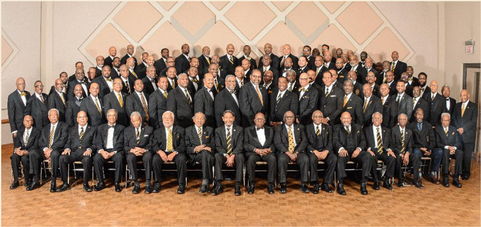
Alpha Phi Alpha Fraternity, Inc., develops leaders, promotes brotherhood and academic excellence, while providing service and advocacy for our communities.

In spite of COVID-19, the Delta Theta Lambda Chapter of Alpha Phi Alpha Fraternity, Inc. continues to support one of the fraternity's oldest national partners, the March of Dimes.