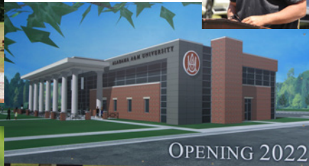
Welcome Center Rendering