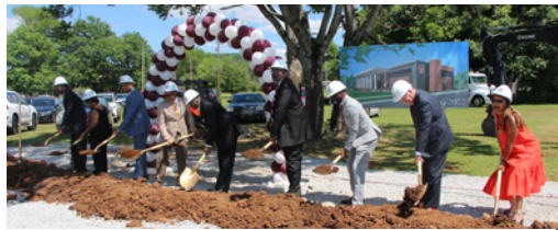
Trustees Break Ground

Meridian Street & Chase Road - Huntsville, Ala.