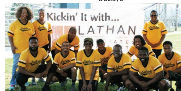
Lathan Associates Architects fielded a team among the dozen competing.

In addition to an all-day kickball tournament featur-