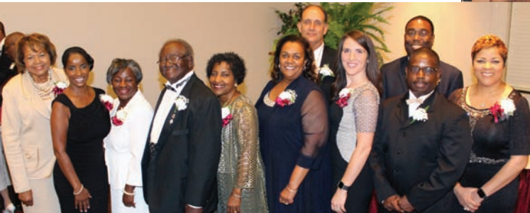
2017 Leadership Honorees