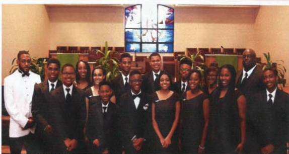
Urban Strings Columbus Premiere

Fun Fact: In 1979, President Jimmy Carter created Black Music Month, but the name was changed to African-American Appreciation Month by President Obama