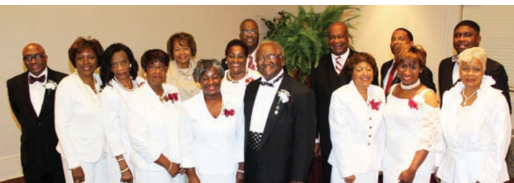
Members of Huntsville Progressive Alumni Chapter