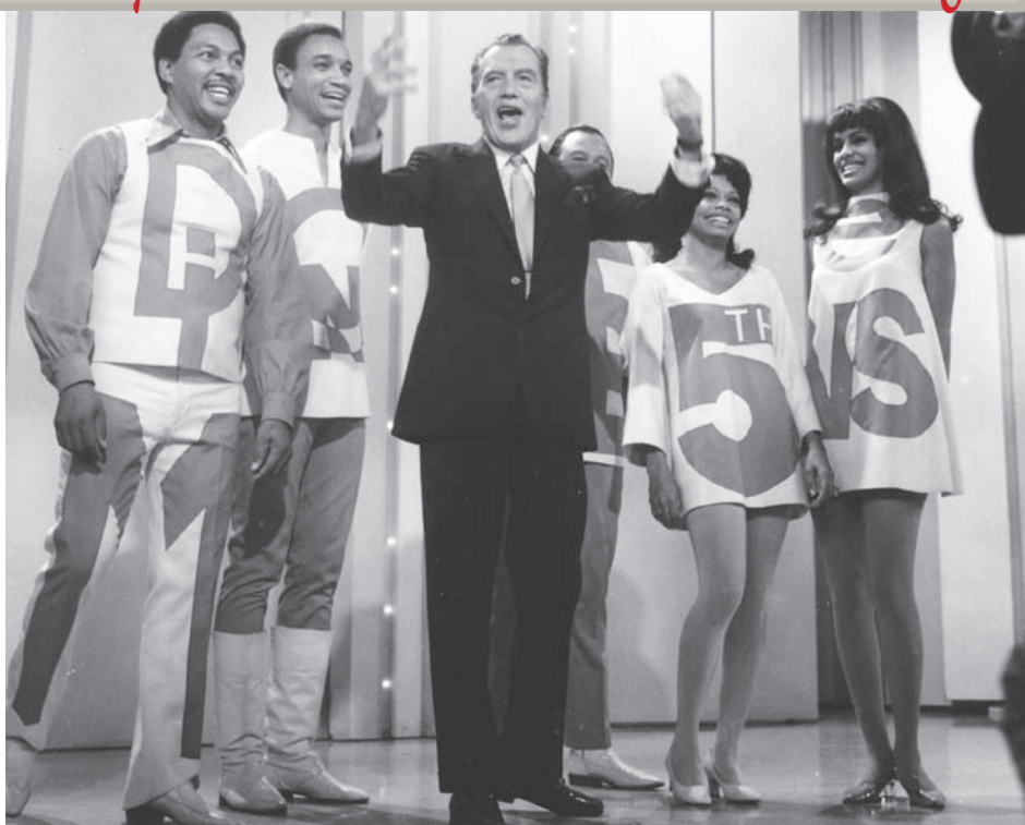
Photo of Sullivan with 5th Dimension

Ed Sullivan is known for creating the longest running variety show and introducing the Beatles to America. What most people don't know is that he was also a risk-taker who booked African-American