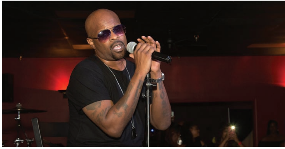
I'm Missing You: R&B veteran Case performed a free show at the Envy Entertainment Lounge on July 30. The intimate performance came months after last minute health concerns forced the "Touch Me, Tease Me" singer to cancel his scheduled appearance at the Von Braun Center with Donnell Jones and Monica. Ticketholders from the previous show were granted V.I.P access, which included a meet & greet with Case.