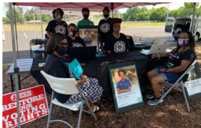
County; Greater Huntsville Interdenominational Ministe-

tancing safety measures. CJCE member organizations include the following: Alpha Kappa Alpha Sorority, Inc., Epsilon Gamma Omega Chapter; The Ivy Center Foundation of Huntsville, Madison County; The Links Incorporated, Greater Huntsville Madison