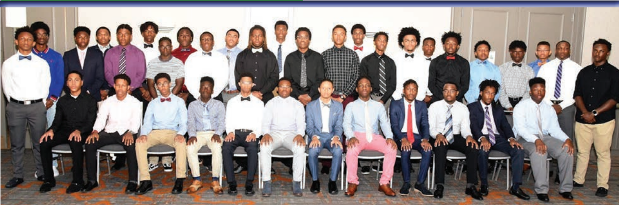
BEAUTILLION KICKOFF: Sponsored by the Fun-Set Charity and Social Club, the kickoff for the annual Beautillion program season was held Sunday, August 11, at the Marriott.