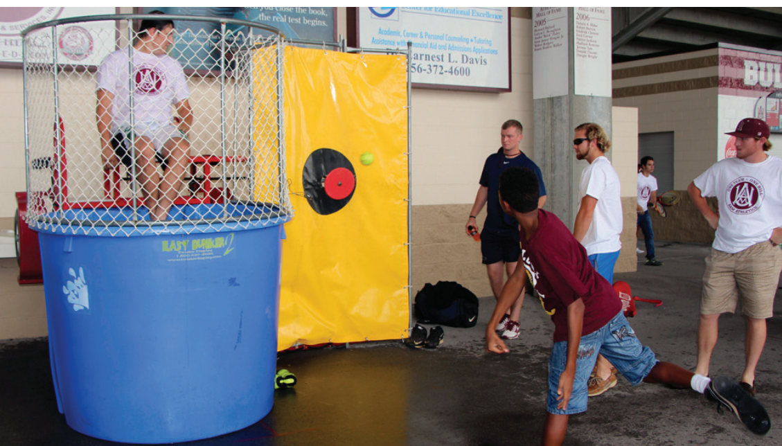
ON TARGET! Student athlete is shown a split second before a pitch lands on target, sending him plunging into a giant bucket of water. The setup was among the fun and games at Alabama A&M University's annual Fan Day held Saturday, August 22, at Louis Crews Stadium.

In the 2014 legislative session, the General Assembly changed the Board's name to Board of Science, Technology & Innovation. To meet these goals, the Board works to investigate new areas of emerging science and technology and conducts studies on the competitiveness of state industry and research institutions in these fields. The Board also works with the General Assembly and the Governor to put into place the infrastructure that keeps North Carolina on the cutting edge of science and technology.