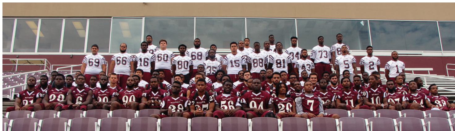
The 2015 Alabama A&M University Bulldog Football Team

Nov. 5 - at Missouri Nov. 14 - Alabama Nov. 21 - at Arkansas Nov. 28 - Ole Miss