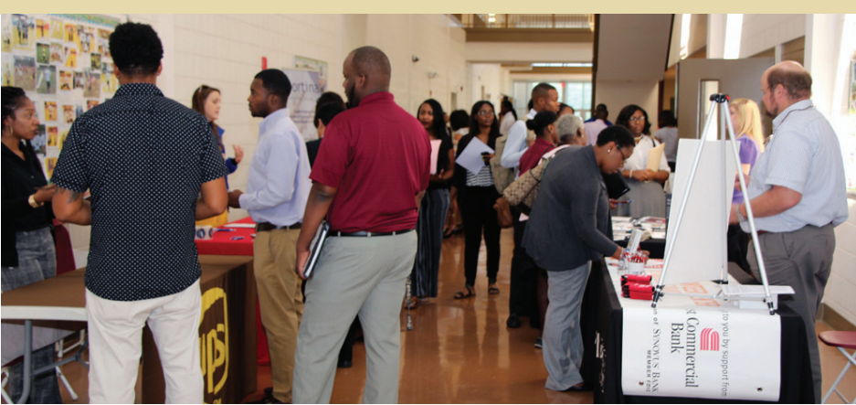
PART-TIMERS: Alabama A&M University students attend a recent Service Learning/Part-time Job Fair to secure volunteer and part-time opportunities set up through the Career Development Services unit at AAMU. The event was held in AAMU's Wellness Center.

To register, contact BBBSNA.org/BFKS2016.