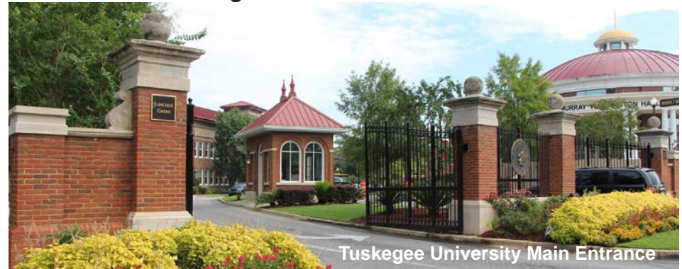
Tuskegee University Main Entrance

Last Thursday, September 10, Alabama Governor Kay Ivey awarded over $72 million in CARES Act funding to higher education institutions in the state.