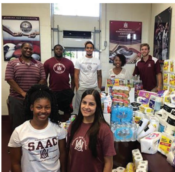
AAMU Student Athletes Give Big: The AAMU Student-Athlete Advisory Committee held a healthy competition between athletic teams to collect donations for Hurricane victims in Florida. Students collected water, non-perishable goods, toiletries and more! Victory World Outreach, a church in Huntsville, will drive to Miami to deliver the donations later this week.

Venus, at a trine with Pluto, means that your integrity may be on the line at just the time when someone else's ethical sentiments and good manners are impressing to you.