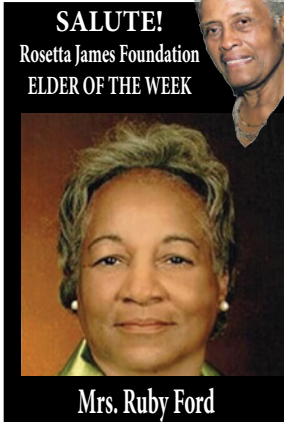
SALUTE! Rosetta James Foundation ELDER OF THE WEEK

Friday October 1, 2021 Vol. 8, No. 4 ValleyWeeklyllc.com