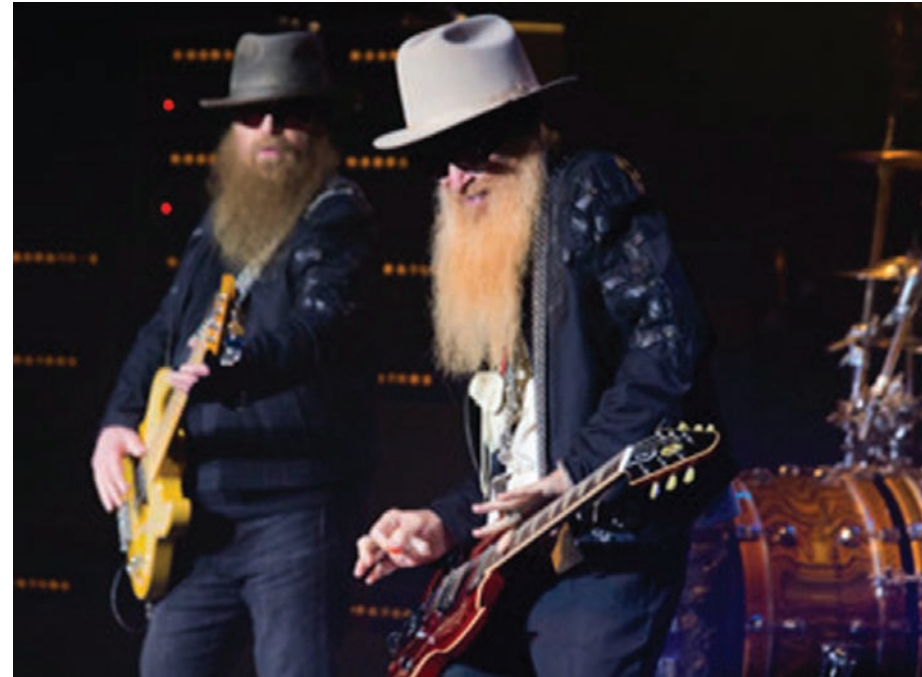
IN CONCERT: Huntsville concert-goers had the awesome experience of witnessing the performance of ZZ Top on October 18, almost four years to the date of their last performance in the Rocket City. The American rock band is made up of bassist and lead vocalist Dusty Hill, guitarist and lead vocalist Billy Gibbons and drummer Frank Beard.