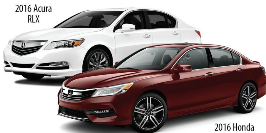
2016 Acura RLX