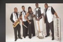
Featuring Live Uptown Entertainment Band (UEB) Sponsored by Public Charities