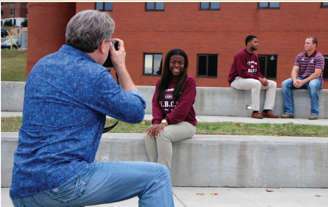
STRIKING A POSE: Students at Alabama A&M University make a series of poses as part of preparations for another round of billboards that will be displayed around key metropolitan areas throughout the state, including in Mobile, Birmingham, Huntsville and Decatur.

The planning focus in this area of the campus is on where to best position the library, driveways and parking areas; façade and entryway needs for the theater and gyms; and streetscape/greenspace improvements along the Bailey Cove frontage.