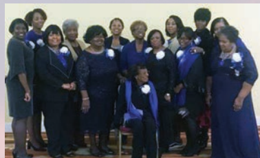
2018 Members of the Society of Professional Women (SOPW)