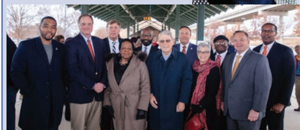
Inaugural Rosa Parks Event Huntsville, Ala. - December 2019