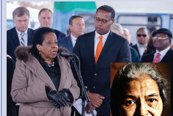
Huntsvillians honor civil rights icon Rosa Parks.