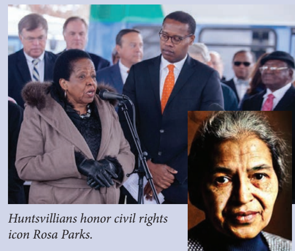
Huntsvillians honor civil rights icon Rosa Parks.